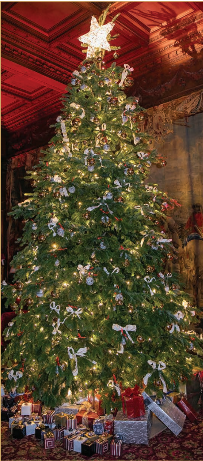
Design by Baylis Media Ltd.

Due to Covid-19 and government safety guidelines, all events are subject to change or cancellation. All details were believed correct at the time of publishing.